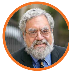
ANTHONY GRAFTON Senior Residential Fellow in the Research Institute for the History of Science and Technology (RIHST)